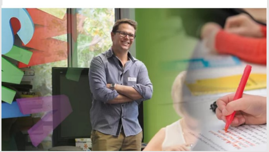
God Bless, The Leadership Team

If you are unable to attend and would like to offer some feedback, suggestions or seek clarification on any school matter please do not hesitate to email a member of the leadership team, your class representative or <a href="mailto:info@sjsh.catholic.edu.au">info@sjsh.catholic.edu.au</a>