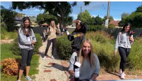
WATCH ONLINE: Head to our Facebook Group 'St Joseph's Community Group' And watch the teachers thank you message.

Teachers have noted how independent and resilient our students are. Well done!