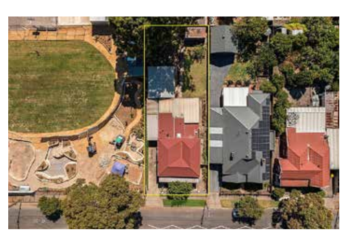
Purchase of 31 Bertie Street, West Hindmarsh